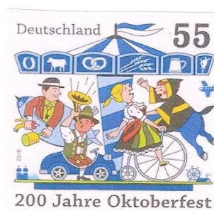
German issued Postage Stamp from 2010

Thank you for your kind consideration! The Sunday Social Kitchen Crew