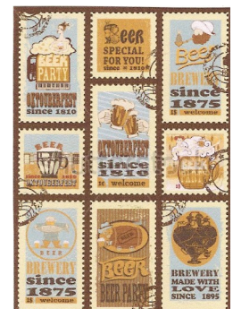
Decorative stamps being used in addition to regular postage