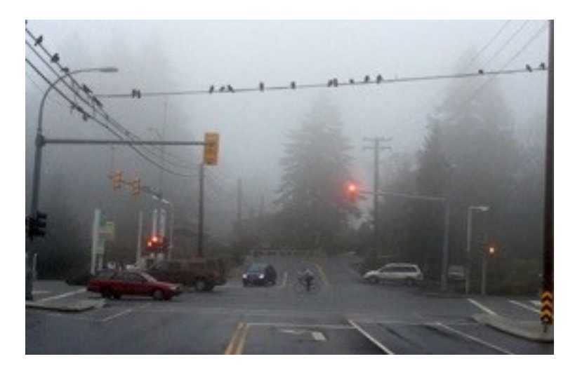
Crows 'waiting for the lights' at the intersection of Sayward Rd and the Pat Bay Hwy.