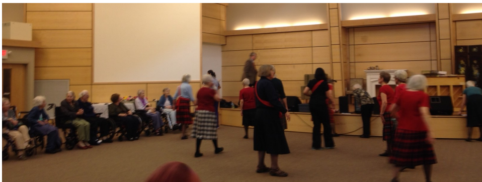
Scottish Country Dancers performing April 25th at the Sidney All Care

We are having a bagpiper outside to greet everyone as they arrive. Come at 6:45 pm to hear him play. All ages are welcome. You can bring your daughter, son, grandchildren, nieces, nephews, etc, but you can also come alone. The dances are easy and called and several of them will have dancers changing partners many times. You can come watch or dance. There will be refreshments. Cost is $5 per person or $10 per family. All proceeds to The Centre. It will be a fun night! Hope you can come out and help us celebrate