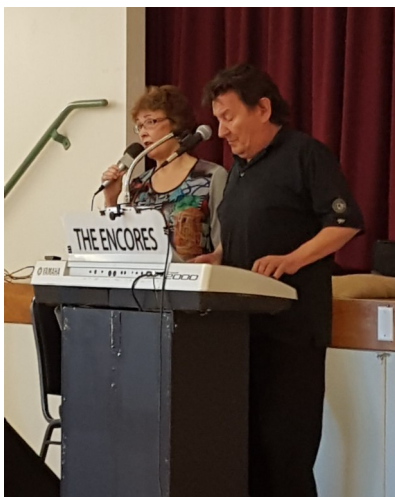
The Encores entertained the members with 50's, 60's, & 70's hits.