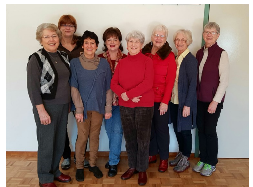
The Vintage Wedding Dress Event committee

Place in saucepan & heat slowly until gelatin & butter are melted. Pour into blender & blend for 50 seconds. Refrigerate, stir well after about 40-50 minutes. May add more milk to thin if needed, stir before serving.