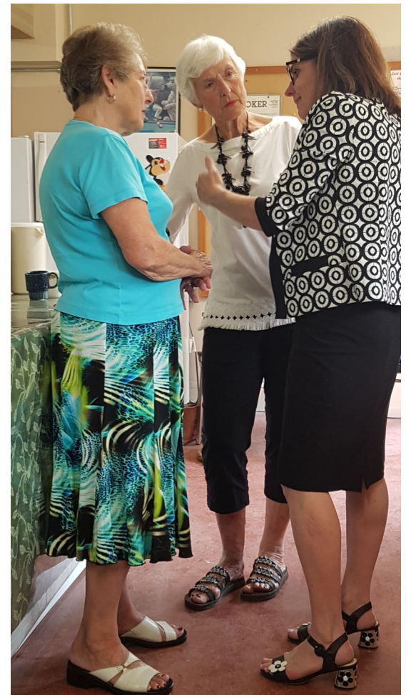
Photo to the right is MP Filomena Tassi discussing issues of concern to our members.

For an update on the kitchen renovations, our next general meeting, Thursday September 13, at 2 pm. Everyone is Welcome.