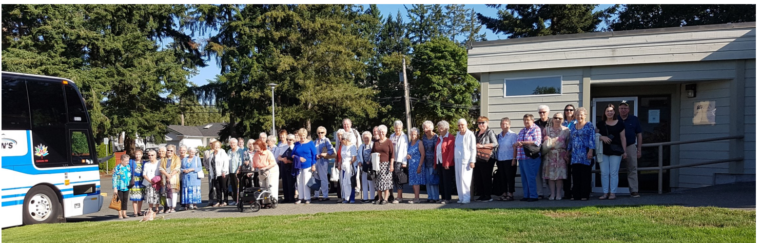
We are off to see the production of "Grease" at the Chemainus Theatre August 18th. Our next trip