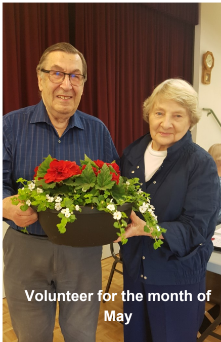
Volunteer for the month of May