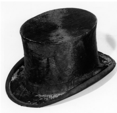
The Beaver Felt Hat

The Beaver Felt Hat was fashionable across Europe during the period 1550—1850 because the soft yet resilient material could be easily combed to make a variety of hat shapes including the familiar top hat. After the severe depletion of the European beaver in the 16th century, the only remaining beaver supply was located in the northern part of North America. The used winter coats worn by Native Americans were actually a prized commodity for hat making because their wear helped prepare the skins and making the pelts more pliable.