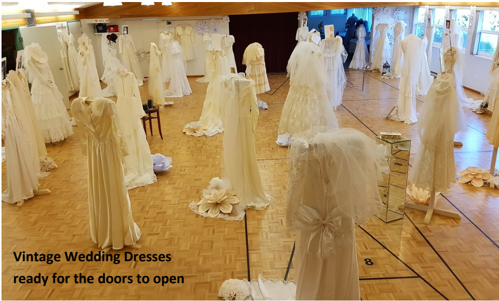
Vintage Wedding Dresses ready for the doors to open