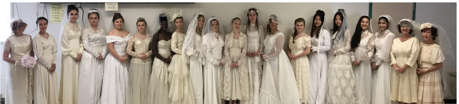
20 models, modeling 31 vintage wedding dresses. What a line up of beautiful ladies. I was so proud of them all.