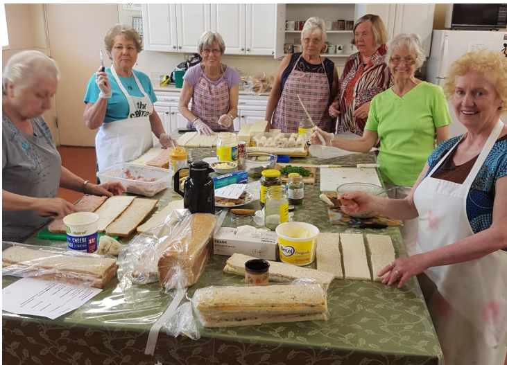
Committee members preparing dainties for the Tea