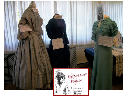
Victorian Vogue displayed wedding gowns from 1840, 1870, early 1900s