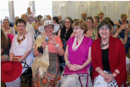
The ladies from the Red Hat Society joined us for the show