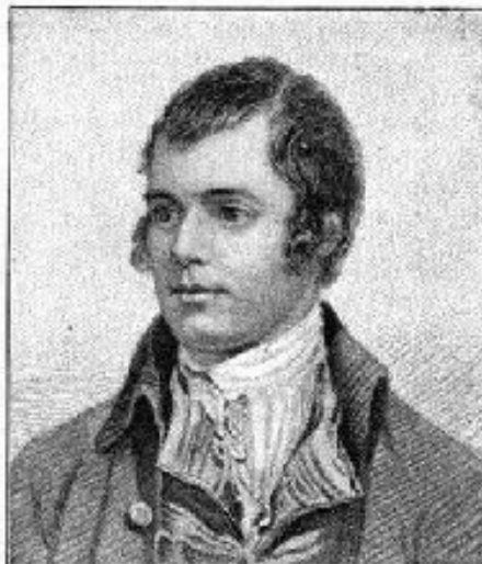
From the painting by Ramsay, National Portrait Gallery.