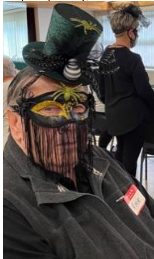
(Guess who?)