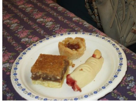
(The goodies were “spooktacular” as well.)