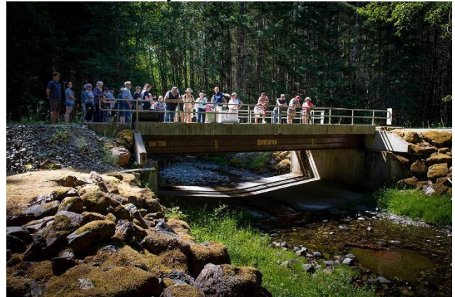
(Above: A group tours the watershed.)

More detailed information for this trip to follow in mid-May.