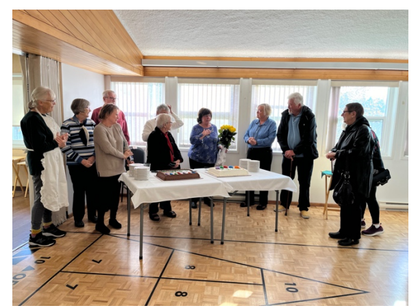
The Centre's 40<sup>th</sup> anniversary at this location was celebrated on November 16 this year.