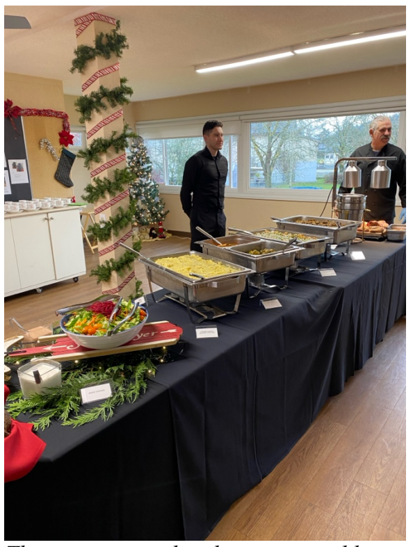
The scrumptious lunch was catered by Island Culinary Service.

The Jammin' Seniors entertained at the Bake And Craft Sale.