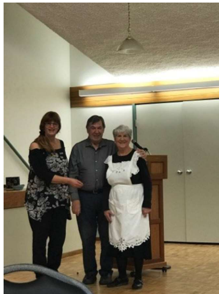
November Sunday Social door prize winners