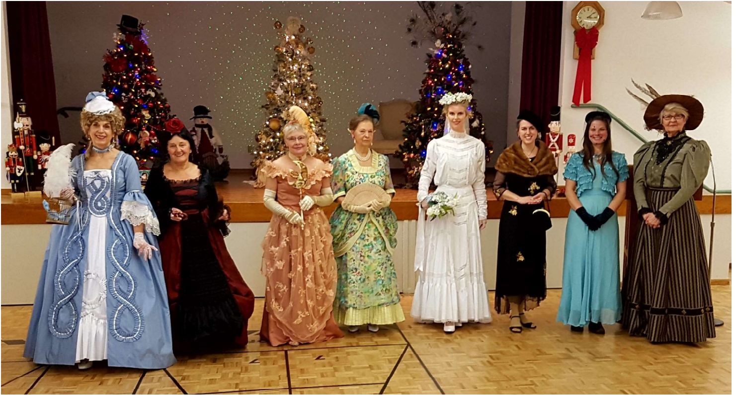
Victorian Vogue models from the November Sunday Social for the historical fashion show.