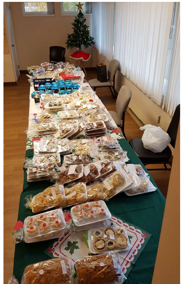
Photo to the right, delicious baked goods baked by the mild fitness and aerobics groups