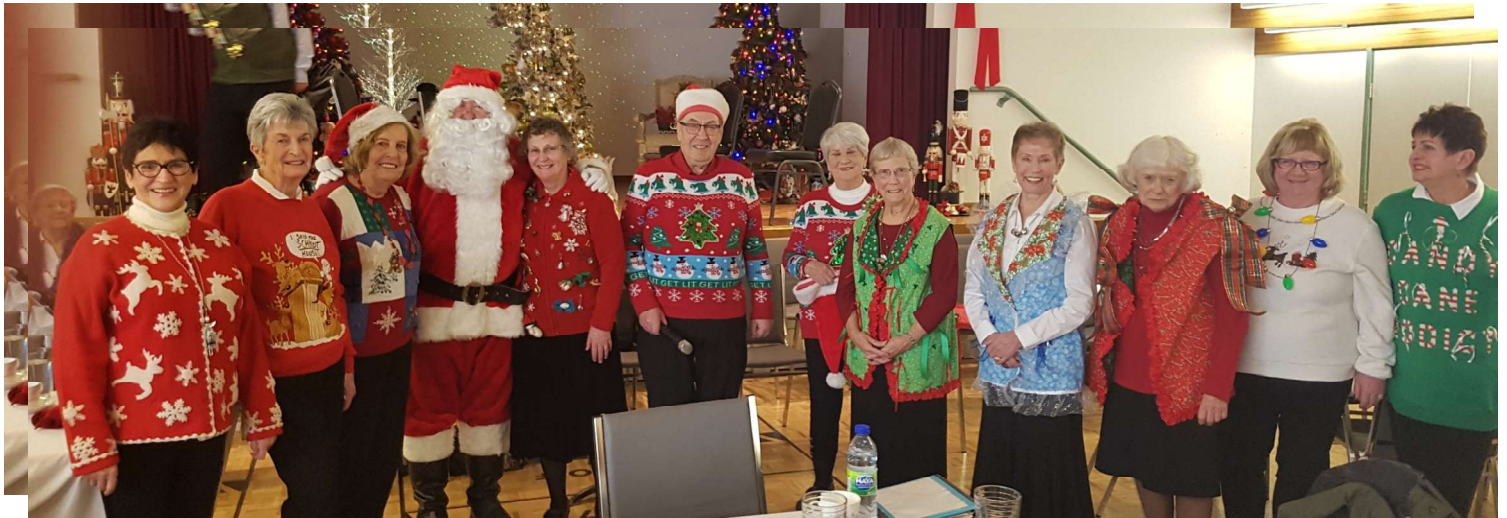
The Ugly Sweater and not so Ugly Sweater Finalists