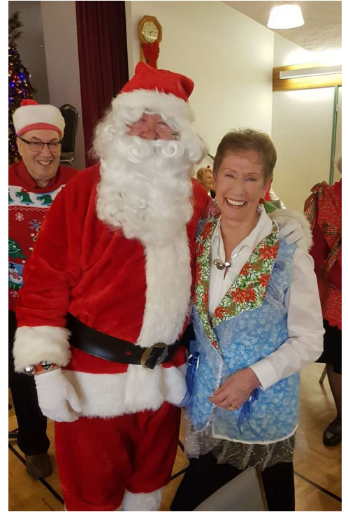
Ugly sweater winners above, door prize winners below