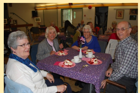
The Strawberry Tea was a great place to catch up with friends or to come and meet new friends. There were several guests that came with CSSCA members.