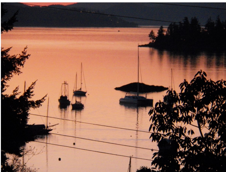
Summer on the Bay